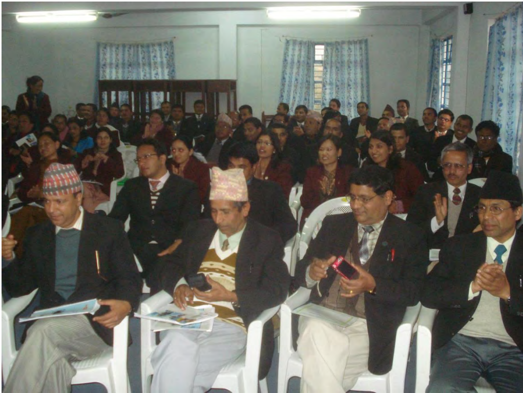
Teachers of GBS school