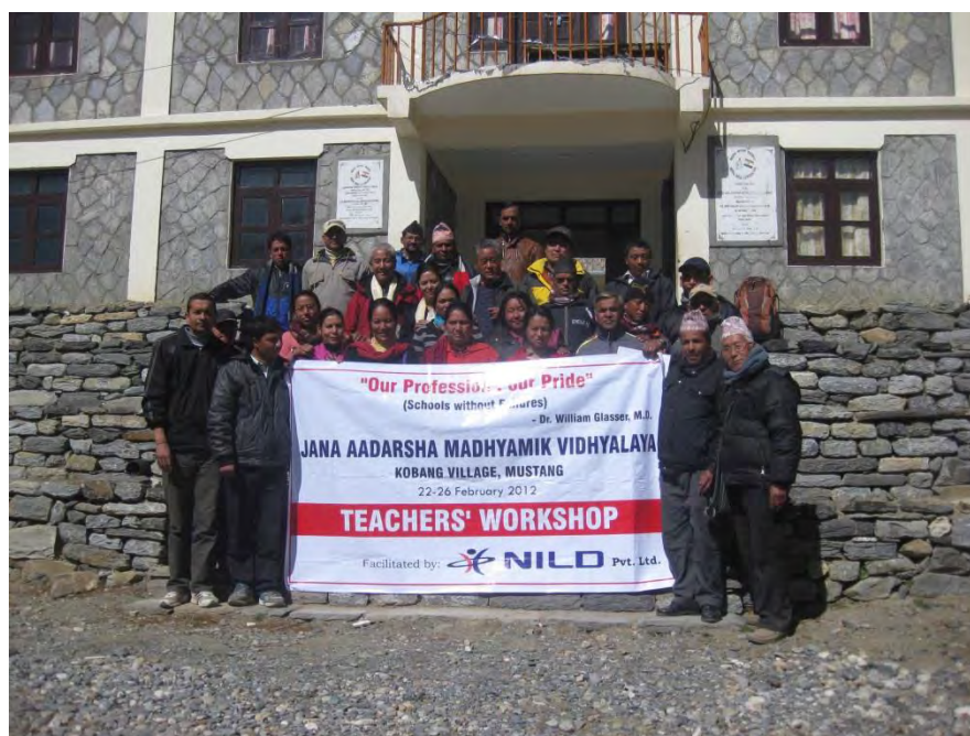
Teacher's Training-Mustang Public School